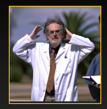
Is this you?